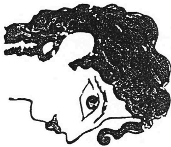
Japheth—Creton (wall painting at Knossos)