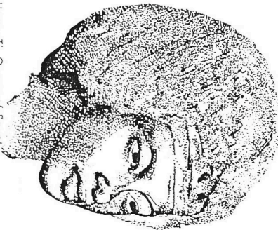
Ham—Ti, Queen of Egypt (beginning of fourteenth century B.C.)